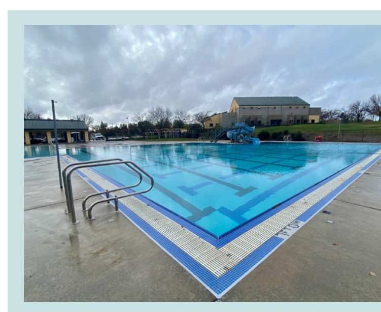
The Orangevale Community Pool has recently undergone a significant renovation, making it feel "like new" for the 2024 aquatic season.

Boys 6 & under Girls 6 & under Boys 9-10 years Girls 9-10 years Girls 13-14 years Boys 7-8 years Girls 7-8 years Girls 11-12 years Girls 15-18 years